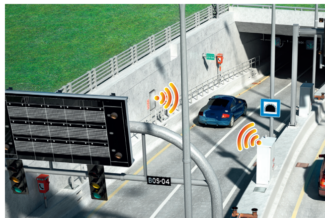
Smart Cities & Traffic Systems